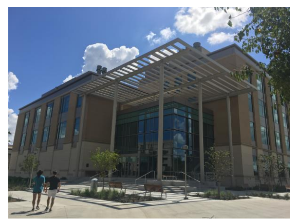
Texas A&M Plant Pathology & Microbiology Building

The decision to pursue graduate studies is one of the most important choices you will make in your career path. You are mapping the course of your future. With your undergraduate degree, you could have entered the workforce as a scientist, but by continuing your education you are enhancing your future professional opportunities. By choosing graduate studies you have decided that you want to be a leader in the arena of life science research. teaching, and/or extension.