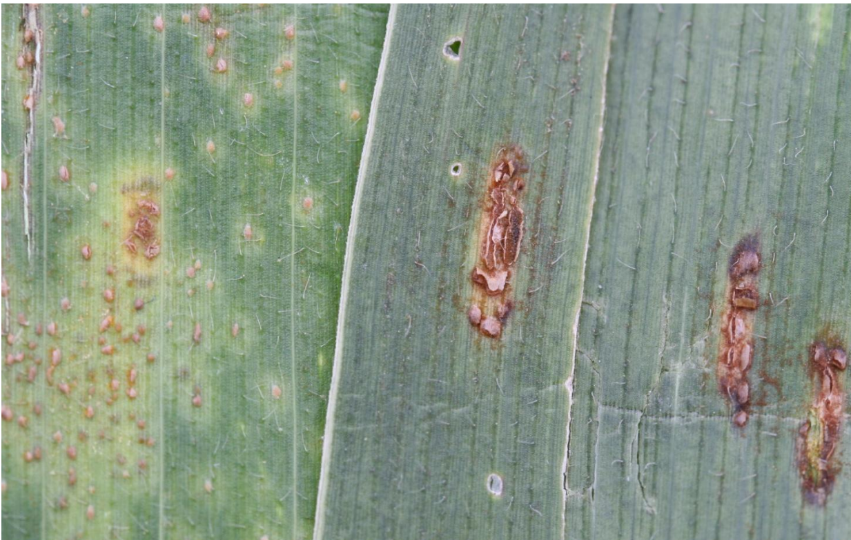
Fig. 1. Pustules of southern rust, caused by Puccinia polysora (left side of photo), in comparison with common rust pustules, caused by Puccinia sorghi (right side of photo). Common rust is seen on foliage early in the season, but its development is hindered by high temperatures, while the amount of southern rust increases over the growing season, if warming temperatures occur with frequent rain or heavy dews.

The purpose of a fungicide application is to protect the upper leaves of the plant during the period of kernel development. If it is applied too early (e.g. the vegetative stage), it may not protect the critical leaf tissue and another fungicide application may be necessary. Since all fungicides work by preventing pustule development in some manner, they need to be applied before a significant amount of disease is showing in the upper leaves. The benefits of a fungicide application will be affected by hybrid susceptibility, timing of infection, and environmental conditions that support disease development. A late-planted, highly-susceptible hybrid in a growing season with frequent rain showers is at highest risk from severe disease development and will probably benefit from a fungicide application.